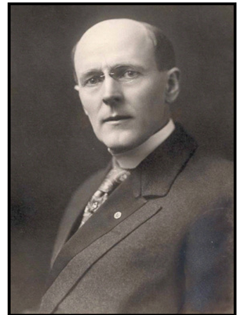
Paul P. Harris

“Since February 23, 1905, the day when the first Rotary club had its first meeting, up to the present time, comparatively few clubs have given up their charters. When one considers the ephemeral nature of many organizations, the longevity of Rotary clubs is surprising, particularly so in view of the fact that all clubs must be active in order to retain their charters. Even during the depression, Rotary has held its own remarkably well. At the present time the increase in the number of clubs and the increase in the membership of existing clubs, steadily continues.”